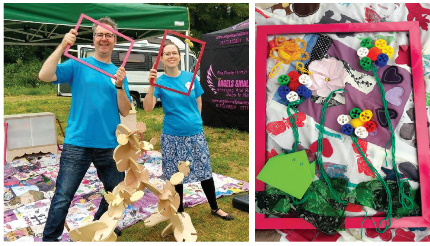
FIGMENT Derby 'On The Road'