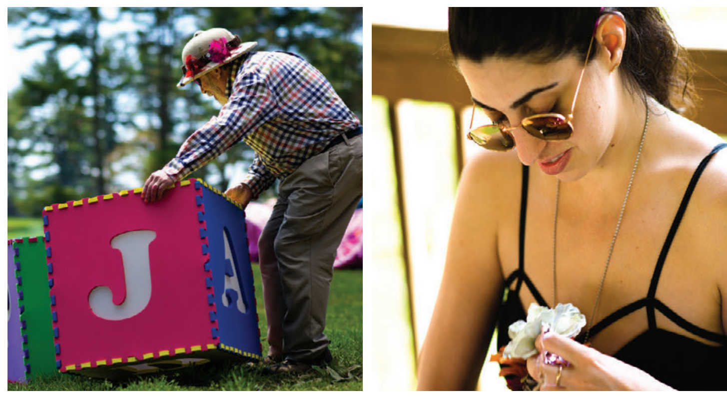
AlphaBlocks by NDWYCO

Our sixth annual ticketed camp-out event for makers, creators, and artists, continued the tradition of celebrating the boldness of creative experimentation. From April 27–29, Camp Ramblewood in Darlington, MD, was a place to launch new art projects, to fail, to improve existing projects, to collaborate, dive in, and create something new, something unexpected. ALPHA is a safe space of community, openness, friendship, invention, and play—equally invested in teaching and learning.