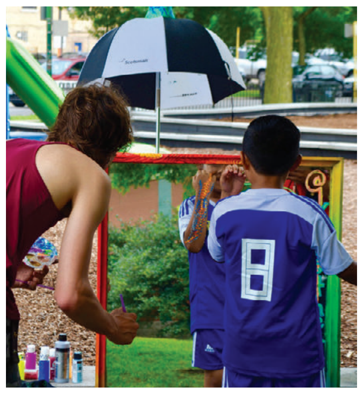
Face Painting by Dan Spectre Asseo / Photo © 2018 Sara Muskulus