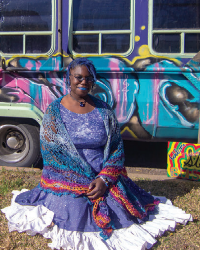
Bustacio Art Bus