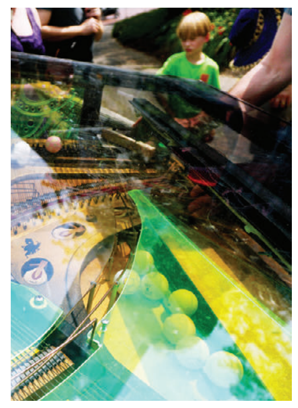
MetaPiano by Seth Avecilla and Floor van de Velde (Project MetaPiano Team)

FIGMENT Boston's ninth consecutive annual event turned The Rose Kennedy Greenway into a large-scale collaborative artwork on July 28–29. The team used tent structures to add an element of togetherness to the space, allowing artists to be close, but separate. Saturday's FIGMENT After Dark component (6–11pm) transformed Dewey Square into a dance party, a celebration of light and projection art, with many visitors bringing lit-up elements and costumes to the party.