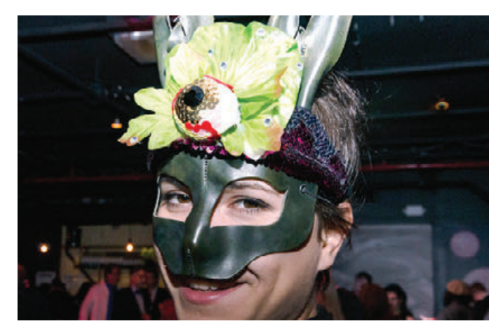
FIGMENT Global Masquerade and Fundraiser

FIGMENT Oakland and Oakland Parks, Recreation & Youth Development developed a second year of free children's summer art classes in Mosswood Park. Says the Oakland team: "Everyone who brings a project to FIGMENT was introduced to creating by someone in their life. We love being part of the community that inspires and encourages that exchange. So we decided to expand our scope, to look beyond our event, and to dig into supporting Oakland, and future Oakland artists, in new ways."