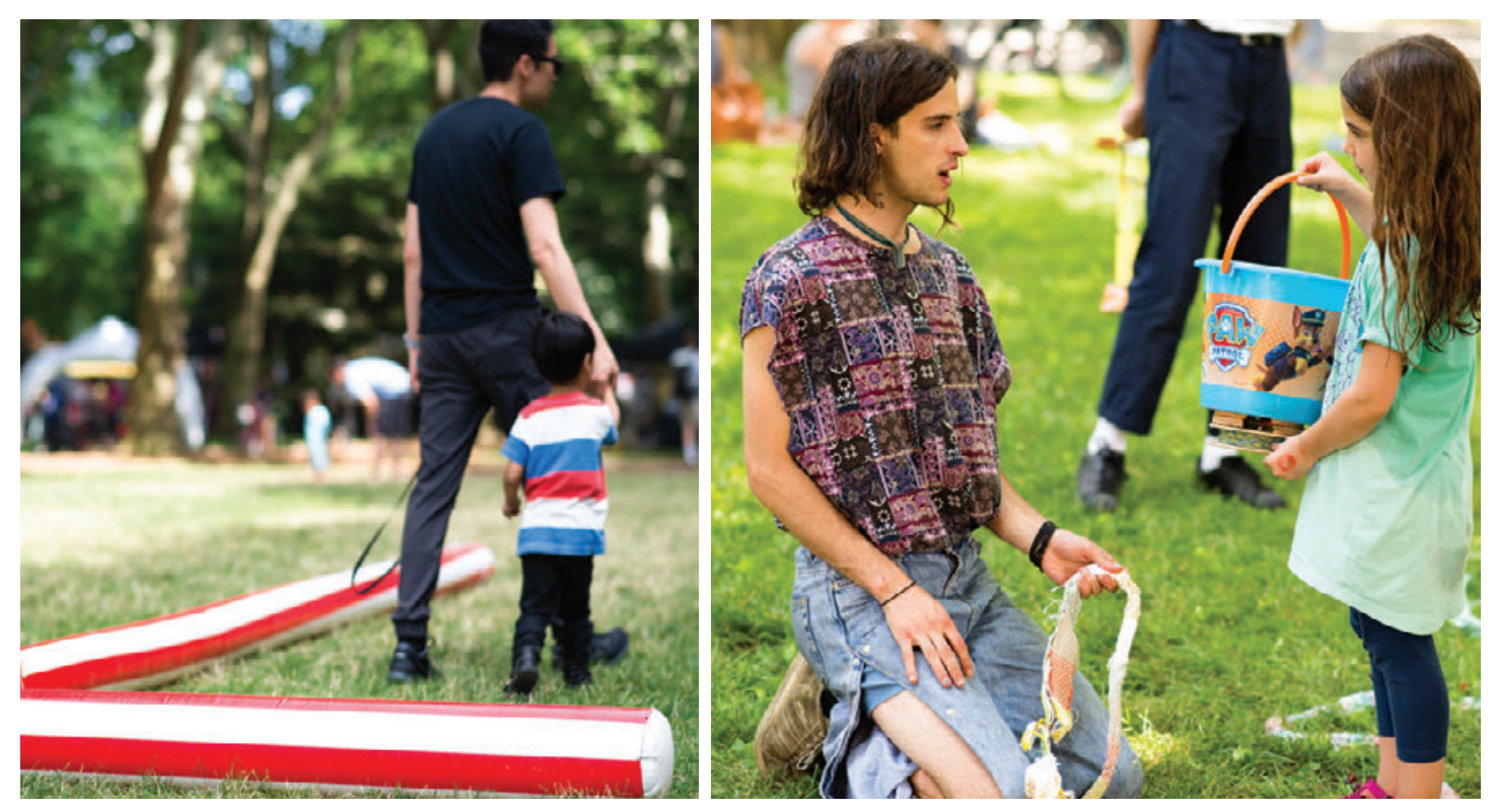
Natural Plasticity by Cruder La Penta / Jane Cruder. Dream Bigger