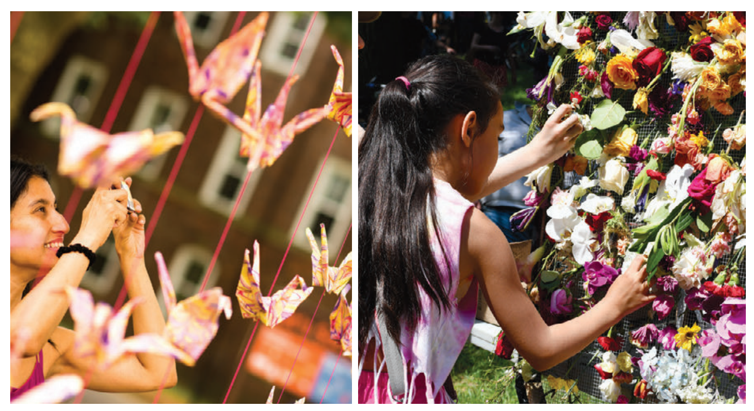
Flights of Fantasy by Helen Chin