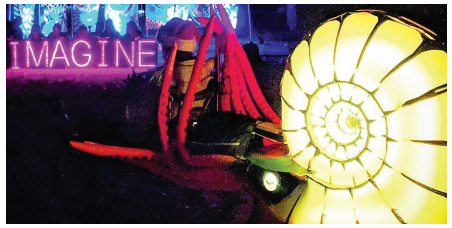
Fosscycle with NTLB / Photo © 2018 Tanja van Haasen

For the first time ever, FIGMENT went to Texas in 2018! Over 30 artists, interactive public art pieces, musical acts, games, sculpture, immersive environments, and more came together at Reverchon Park in Dallas on Saturday, December 1. Visitors were encouraged to bring their picnic basket, decorate their stroller or bike—and costume up! FIGMENT Dallas began in the morning, but went into the evening hours allowing for illumination and light art projects.