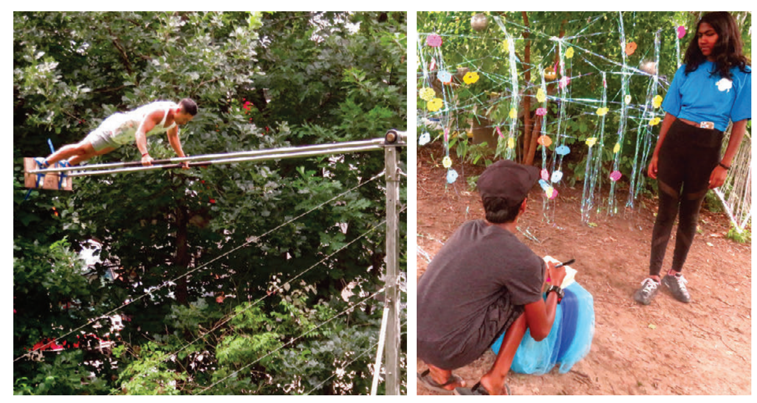
The Moon Shot by Matt Culver