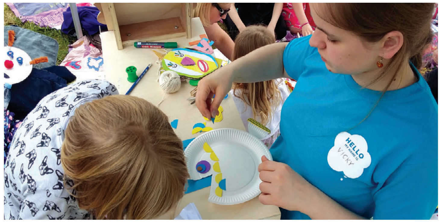
FIGMENT Derby 'On The Road'

Although there was no official FIGMENT Derby event in 2018, the team spent the season prototyping new ideas for FIGMENT Derby with a series of 'on the road' pop-up events at area community festivals. The team used the pop-ups as a way to play with new creations and develop new relationships with artists and communities—especially useful as the civic space that hosts FIGMENT is under development as the new Museum of Making at Derby Silk Mill during 2018–2020.